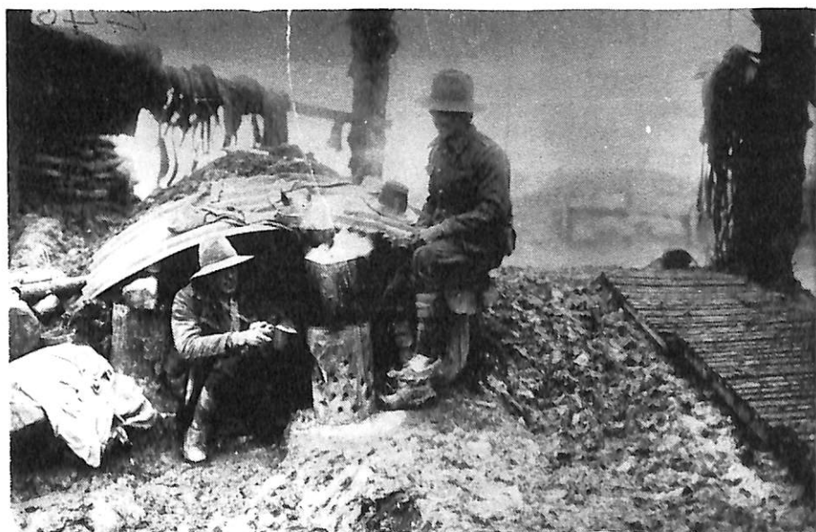
'Brewing up', somewhere in France