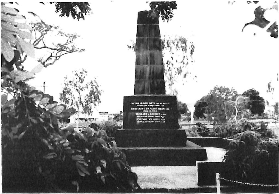
Above: This stone obelisk in Fannie Bay commemorates Sir Ross Smith's pioneering flight from England to Australia, November 12th to December 10th 1919.