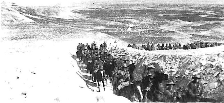
The 11th Light Horse Regiment en route to Nehkl.