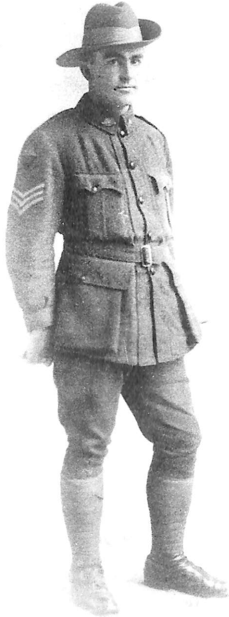
The Australian uniform, first world war

So all guards were well turned out, but what a sneaky way to do it!