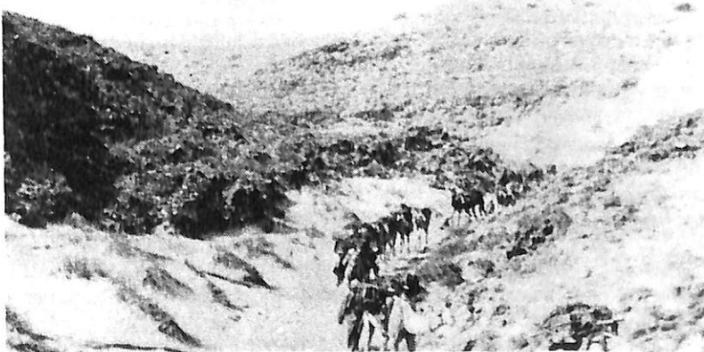
The lighthorseman's despised but faithful ally — the camel.