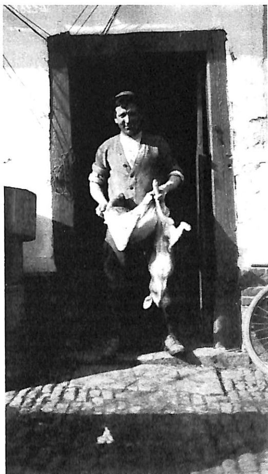
An alternative approach to rations